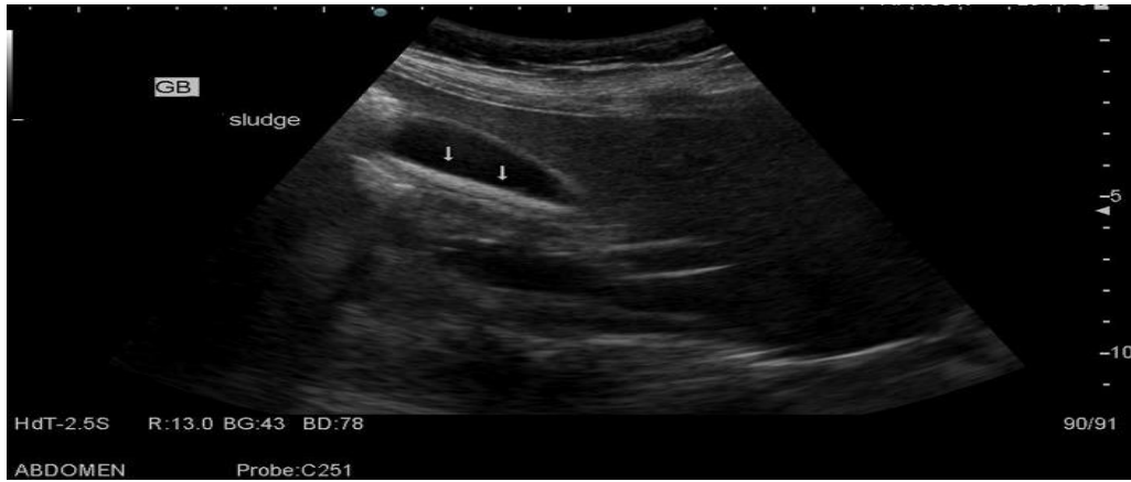
Figure 1: Showing Biliary Sludge as Layering Echogenic Material in Gallbladder without Shadowing