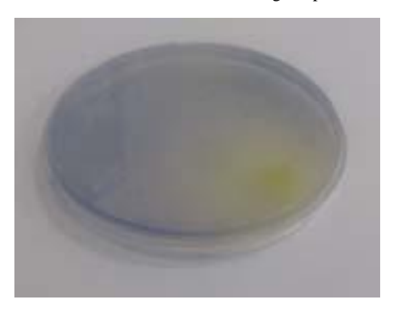
Figure no 2: The growth of C. acnes on Spirit-blue agar with lipase activity (i.e., change in color to vellow).

On Spirit- blue agar, all of the 45 isolates of C. acne (i.e. 100%) were showing positive lipase activity (figure 2). The comparison of optical density (O.D.) of the Thioglycolate broth medium for all isolates measured immediately after the addition of lipid-substrate and that after two hours are shown in table (2). A highly significant statistical difference was noticed between the means using the paired T-test (P=0.001).