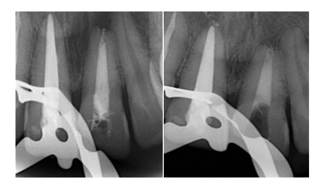
Fig 2: Working length determination irt 21

Fig 3: Calcium hydroxide dressing irt 21