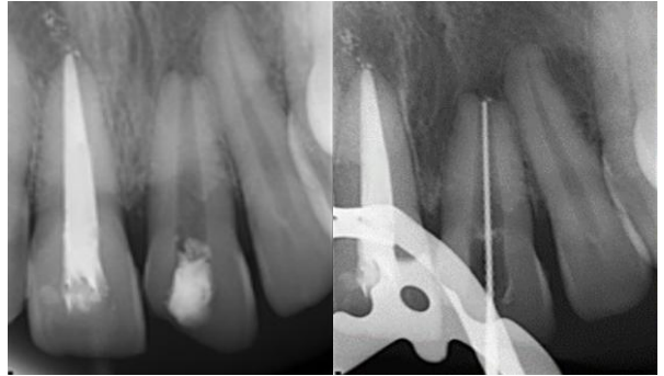
Fig 1: Pre-operative radiographirt 21

After 24 hours the patient was recalled and temporary restoration is removed. The pulp chamber was cleaned with saline to remove any remaining cotton fibers. Then etching is done with 37% phosphoric acid (DentoEtchPvt Ltd) for 15 seconds inside the pulp chamber followed by rinsing. Fifth generation bonding agent (3M ESPE) is applied and cured with curing light (IvoclarVivadent) for 20 seconds. Composite restoration (3M ESPE Filtek Z350 Xt) is done using incremental technique by curing with curing light for 20 seconds (Fig 5).