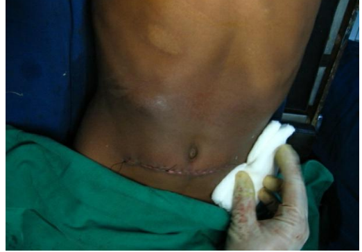
Figure no.5: post-operative wound