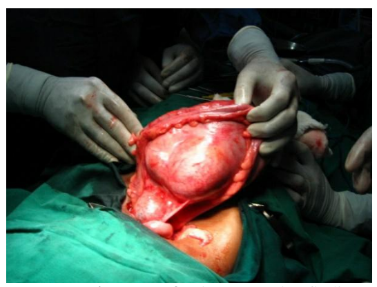
Figure no. 3: intraoperative findings