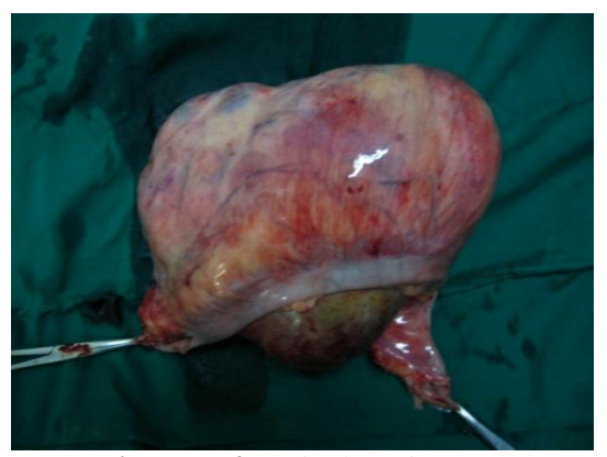
Figure no 4: excised specimen