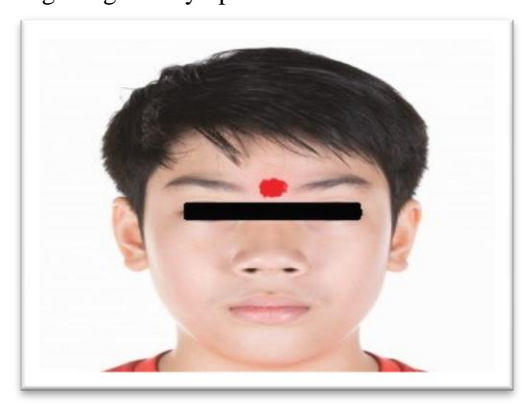
Figure 1: ThilarthaVarmam

It was located in Nasal arch of the frontal bone situated between the two eyebrows.<sup>[7]</sup> This Thilarthavarmam is indicates about SuzhumunaiNaadi (KabaNaadi).<sup>[8]</sup> Therefore, stimulation of Thilarthavarmam improves attention, concentration and Blurting things out symptom of ADHD.