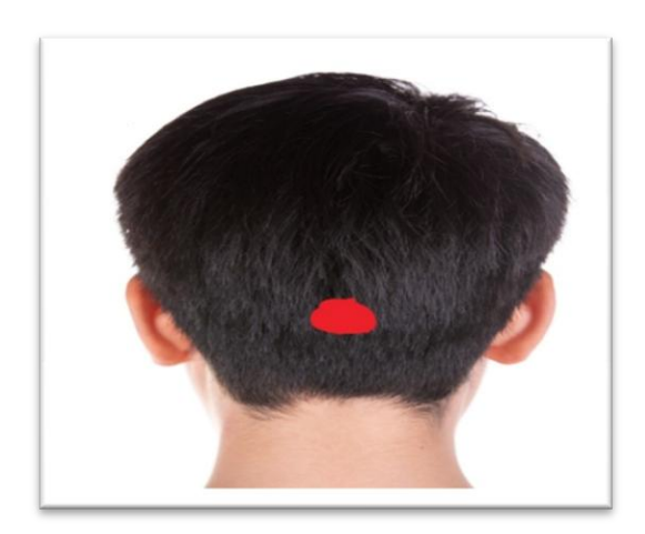
Figure 3: PidariVarmam