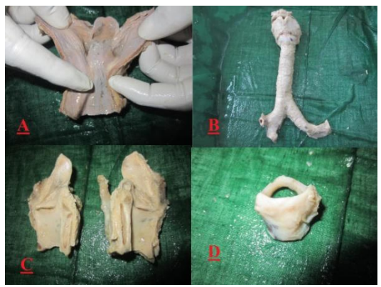
Figure 1 Dissected parts of larynx shown in the chalk board teaching (A=Larynx, B=Larynx with trachea and bronchi, C=Medial surface of larynx, D= Cricoid cartilage)