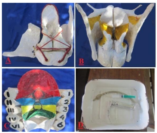
Figure 3 Endotracheal tube and handmade model for the chalk board teaching (A,B= Model of larynx, C=Model of pharyngeal arch, D= Endotracheal tube, Laryngoscope).