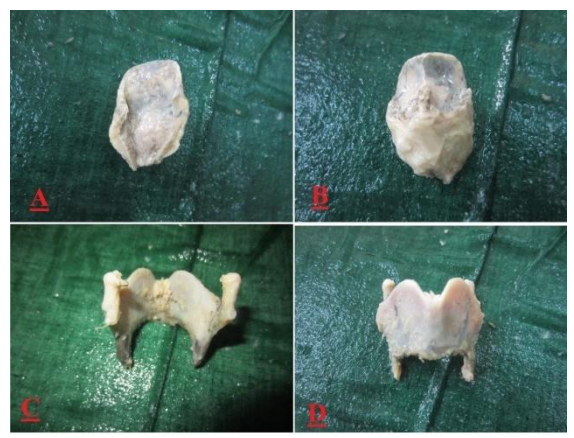
Figure 2 Dissected parts of epiglottis and thyroid cartilage shown in the chalk board teaching (A=Posterior and B=Anterior view epiglottis cartilage, C=Posterior and D= anterior view of thyroid cartilage)