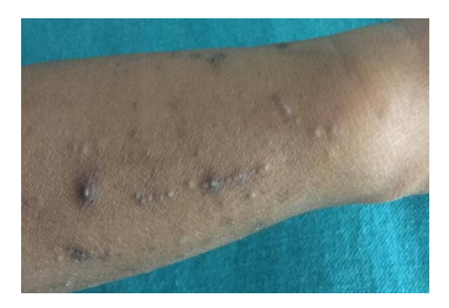
II. Case Report:

• A 9 year old female child presented with extensive dark colored skin lesions over face and extremities since 6 months.