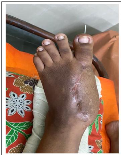
3 rd Follow up shows good wound healing and only mild swelling which gradually reduced overtime

Early and accurate diagnosis allows salvage procedure and prevents amputation. Resection of the affected metatarsal and reconstruction with autogenous fibula with arthrodesis with host bone proximally & distally minimizes the risk of recurrence & provides good functional outcome. As GCTs have tendency for recurrence, regular follow up of operated patient is necessary to detect recurrence at the earliest and institute appropriate treatment