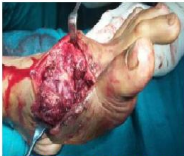
Fig. 4: Exposure and Excision of the tumour