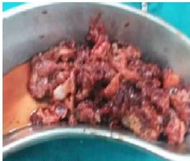
Fig. 5: Resected tumour mass