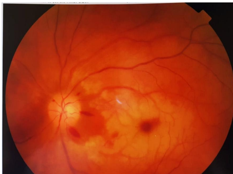
Fig.1: Left fundus photograph displaying diffuse macular edema with an intact choroidal circulation and scattered intraretinal hemorrhages

In the event of a decrease in visual acuity following pancreatitis. The diagnosis of OACR must be evoked in order to achieve an early management, even if the visual prognosis remains poor.