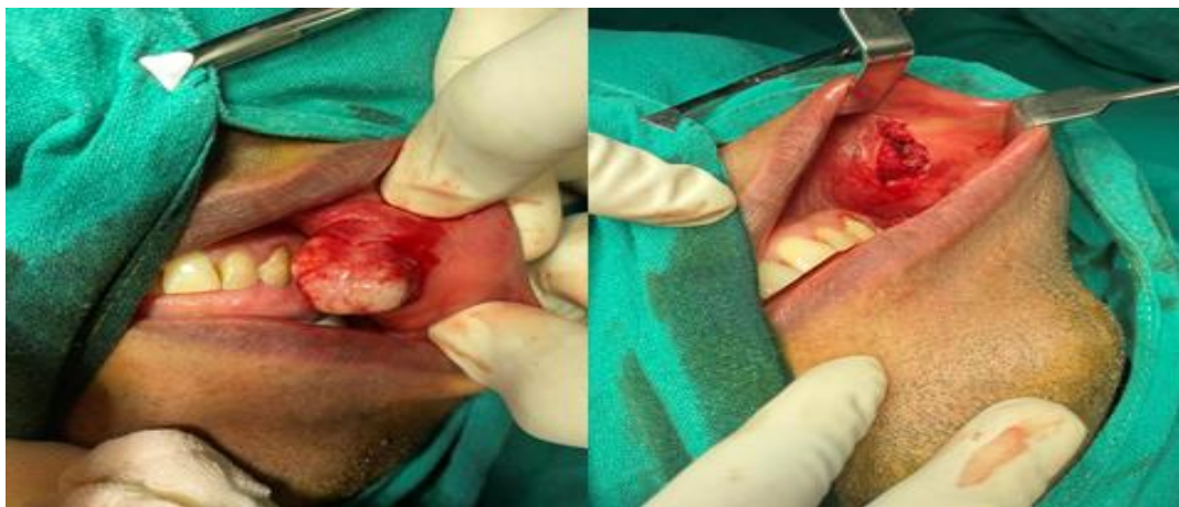
Fig:2 A) Exposure of the lesion B) surgical wound after excision of the lesion.

The patient was taken up for elective surgery. A transverse incision made over the left buccal mucosa, dissection done up to capsule of adenoma. Blunt dissection done around the adenoma and specimen removed with 0.5mm of normal appearing surrounding margin. After achieving adequate haemostasis, wound closed with absorbable loose sutures. Specimen sent for histopathological examination.