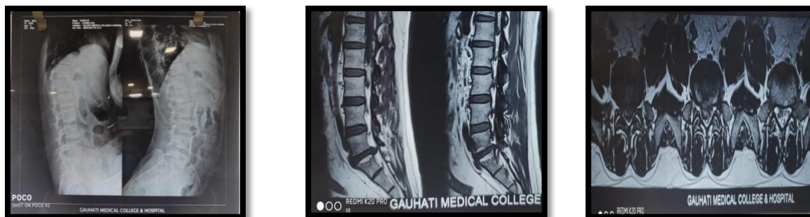
Figure (1-3) : preoperative radiographic assessment