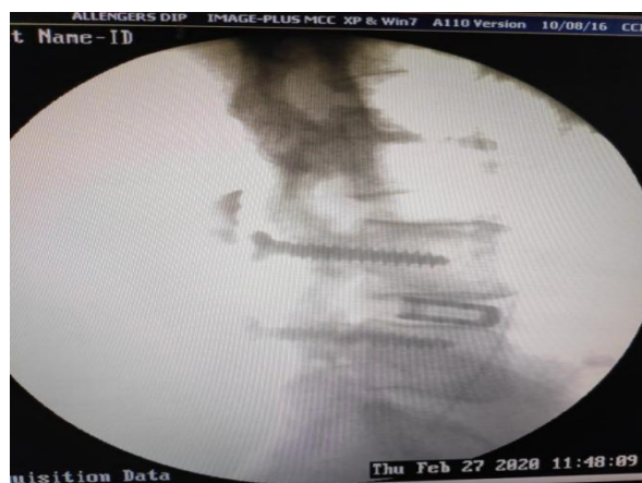
Fig 6- final image of screw with cage

Patient mobilization was generally begun 24- 48 hours post surgery with or without support. No clear consensus exist on the duration of bed rest or type of external support , which depends on the pathologic condition and location and extent of fusion. Immobilization was continued until the patient was comfortable or until consolidation of fusion mass was seen on X-Rays. Starting of physical strengthening therapy of the spine also depends on the above factors..