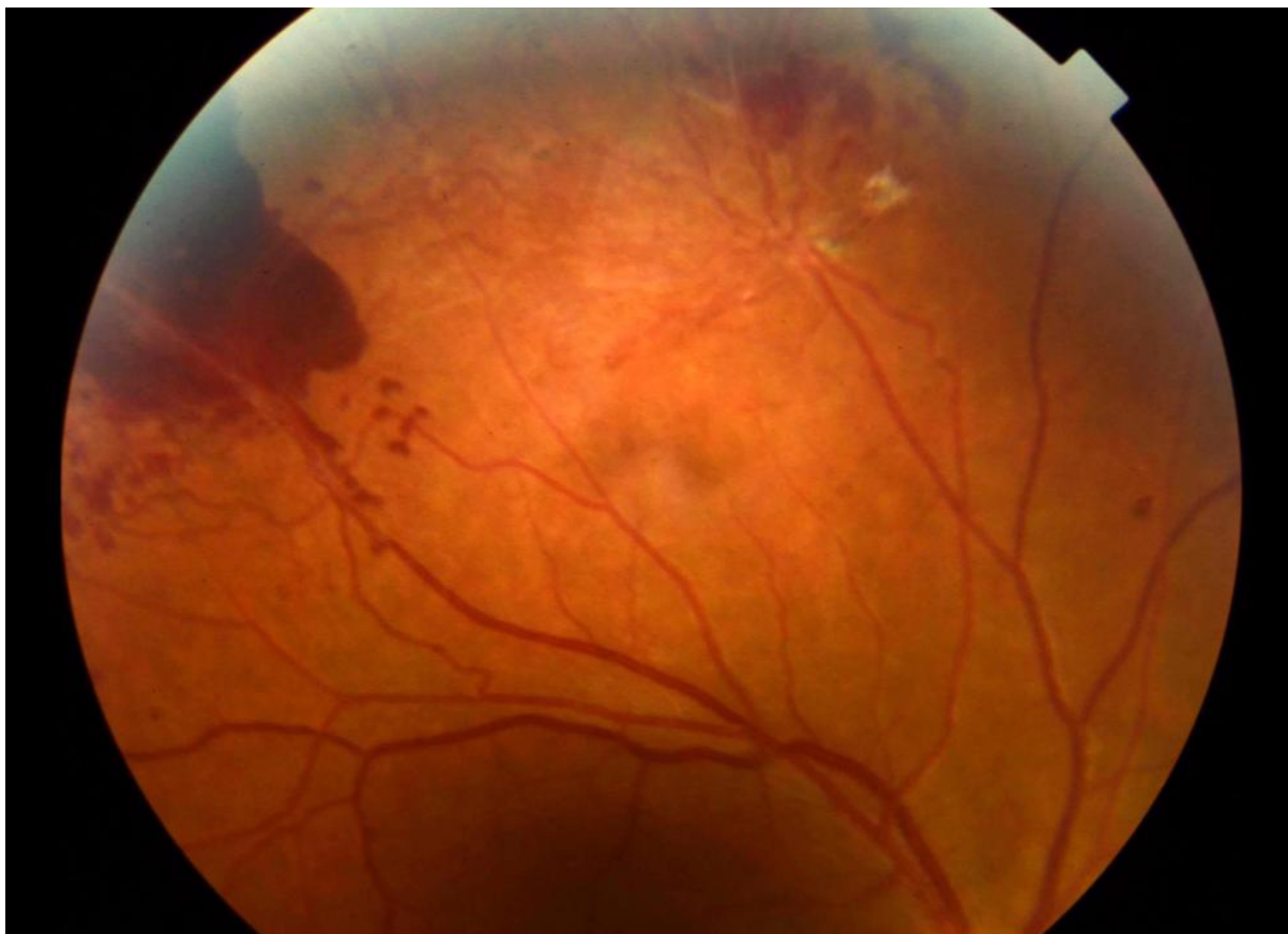
Figure 1: fundus photography showed a subretinal hemorrhage and neovascularizations in the right eye