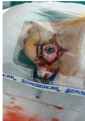
Fig 3: Intra-op

The diagnosis of globe rupture (Fig 2) was based on history and clinical evaluation. Primary repair of the globe was planned under General Anaesthesia. The patient was given tetanus immunization, antiemetics, analgesics, and intravenous broad-spectrum antibiotics. Laboratory tests included a full blood count, liver function tests, INR, prothrombin time, partial thromboplastin time, and kidney function tests, all were within normal. The primary repair involved sealing the corneoscleral laceration using 10/0 Nylon sutures (a total of 8 interrupted sutures). The prolapsed iris was viable and was repositioned by the iris spatula. Hyphema was washed using a bimanual irrigation aspiration technique and an Anterior vitrectomy was done (Fig 3).