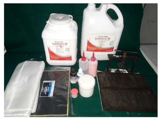
FIGURE1: armamentarium used in the study

> GROUP C - Twenty specimens with carbon fiber reinforcements. Heat activated polymethyl methacrylate (HC-PMMA) resin (DPI), Glass fiber (Fiber region), carbon fiber (Ruthinium fibra), Resina base (Ruthinium fibra), Catalizzatore (Ruthinium fibra) were used in the study.