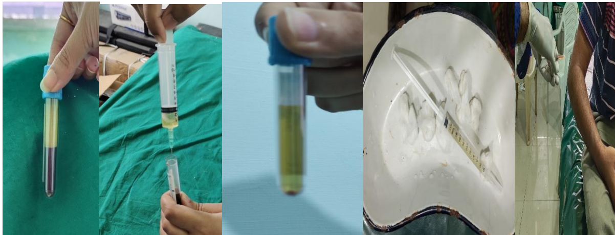
EXTRACTION OF PRP FROM AUTOLOGOUS BLOOD AND INTRODUCTION TO SITE

directly into the area of maximum tenderness using a 22-g needle into the common extensor tendon using a peppering technique. This technique involved a single skin portal and then 5 penetrations of the tendon. Patients in steroid group received 2 ml of methylprednisolone (40 mg/ml, inj). Immediately after the injection, the patients were kept in a supine position without moving the arm for 15 minutes. Patients were sent home with instructions to limit their use of the arm for approximately 24 hours and use acetaminophen for pain. A formal stretching and strengthening exercises of forearm muscles were initiated on 2nd day after injection. At 4 weeks after the procedure, patients are allowed to proceed with normal sporting or recreational activities as tolerated. The patients were assessed using Visual analogue scale (VAS), Disability assessment of Shoulder and Hand score (DASH) score before and after treatment at 2, 8 weeks and 3, 6 months.