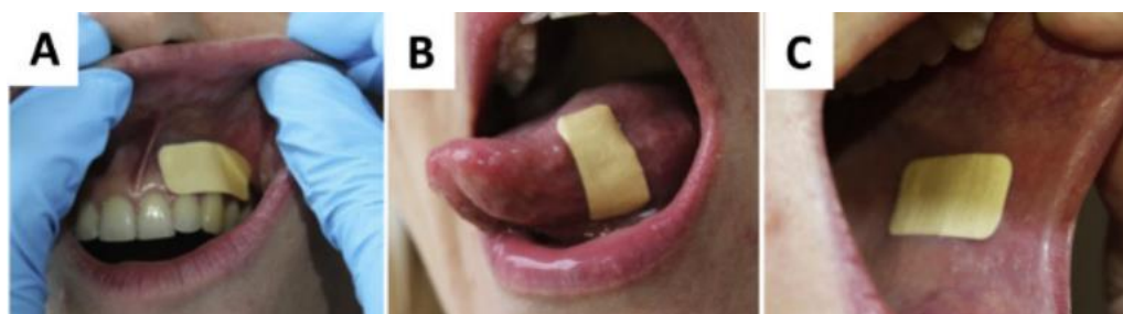
Figure 2: Mucoadhesive Rivelin® patches placed on the (A) gingiva, (B) lateral tongue, (C) buccal mucosa of a healthy human volunteer (21)

A pre-clinical study done by Colley et al (2018) (21) on electrospun patches loaded with the corticosteroid clobetasol-17-propionate for the treatment of chronic oral inflammatory diseases. The patches composed of a drug-loaded (up to 20 µg per patch) layer of mucoadhesive fibres consisting of PVP and Eudragit® RS100 with polyethylene oxide (PEO) particles electrospun from 97% ethanol. To promote unidirectional delivery and improve mechanical properties, a hydrophobic backing layer was introduced by electrospinning a second layer of polycaprolactone from 9:1 DCM/DMF and melting in an oven to produce a continuous film. Drug-loaded patches released 80% of the drug over a 6 h period. This expression is now a commercial technology of AFYX pharmaceuticals with the brand name Rivelin® and recently successfully met the primary end point in phase 2b clinical trials (ClinicalTrials.gov identifier: NCT03592342) for the treatment of OLP, showing a notable reduction in ulcer area, and is on track to become the first such electrospun mucoadhesive on the market.