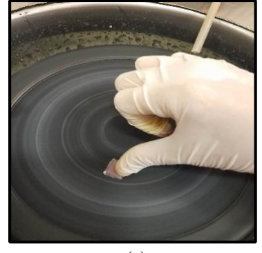
(c) Figure 2a and 2b. Sample after curring Figure 2c. Polishing