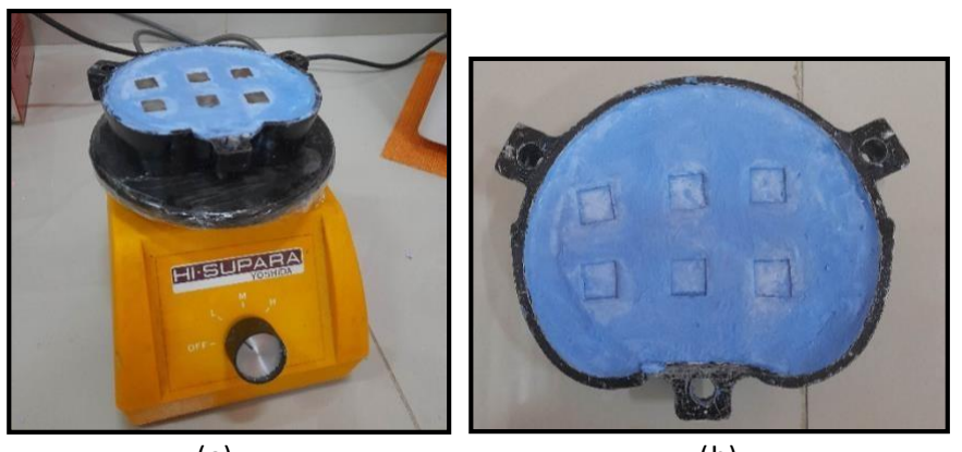
(a) Figure 1a. Making mold

Making the mold begins with making hard plaster dough, the ratio of gypsum to water is 100 grams: 30 ml of water for the top and bottom cuvettes. The dough is put into the cuvette that has been prepared above the vibrator. The main model is placed on the gypsum dough which is starting to harden in the cuvette, the gypsum is tidied up and left to stand until it hardens completely (figure 1a). The surface of the cast and cuvette is smeared with vaseline then the top cuvette is attached and filled with hard plaster dough over the vibrator. After the gypsum has hardened, the cuvette is opened, the main model is removed, the cuvette is poured with hot water to remove the remaining vaseline until it is clean, after it is dry, spread with cold mold seal, wait for 20 minutes (according to the manufacturer's instructions) (figure 1b).