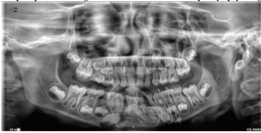
Figure 5:Post op OPG and intraoral photograps showing occlusion after 2 months of follow up.