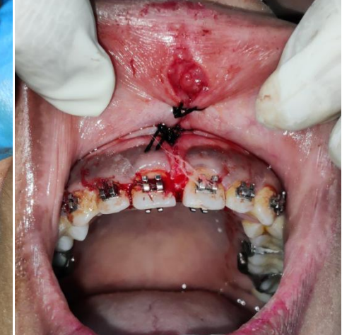
FIGURE 3.PLACEMENT OF 4-0 SUTURE