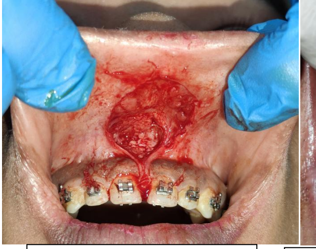
FIGURE 2.POST OPERATIVE