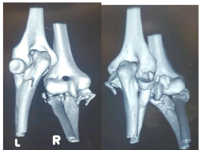
Figure 3: 3D CT imaging of left and right elbows

Boyd's approach, a surgical technique involving the anterior exposure of the radius and the anterior and lateral exposure of the elbow joint, was employed for the left elbow in this case. Through this approach, the radial head and proximal ulna were reduced. The reduction was then maintained by securing these structures with a locking compression plate. In addition, the lateral ligament complex was repaired. This complex is crucial for the stability of the elbow joint. The repair was accomplished with absorbable trans-osseous sutures, sutures that are passed through the bone and are designed to be absorbed by the body over time. Temporary stabilization of the joint was then achieved with the insertion of one radio-capitellar and one ulno-humeral Kirschner wire.