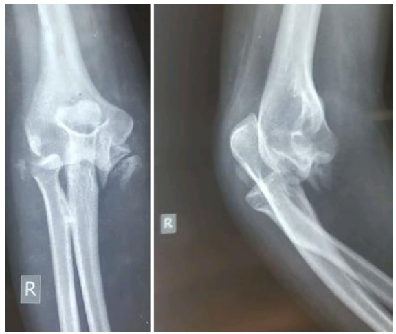
Figure 2: Plain Radiographs of right elbow on presentation (Left: AP, Right: Lateral)