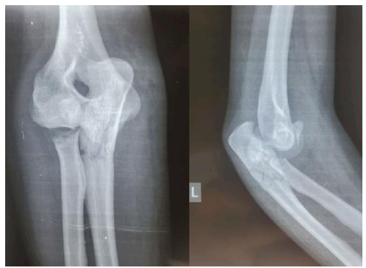
Figure 1: Plain Radiographs of left elbow on presentation (Left: AP, Right: Lateral)

The case report describes a 21-year-old female student who suffered bilateral elbow injuries after falling from the first floor. She presented with acute pain, swelling, and an inability to move both elbows. Clinical examination revealed dislocated elbows with disrupted 3-bone-point relationships but intact skin. The elbows were grossly reduced with traction and posterior slabs in the emergency department, and the patient was scheduled for surgical intervention with open reduction internal fixation. Radiographs and 3-D CT scans confirmed bilateral elbow dislocations, Mason type IV radial head fractures, Regan Morrey type 2 coronoid process fractures, and a proximal ulna fracture on the left side.