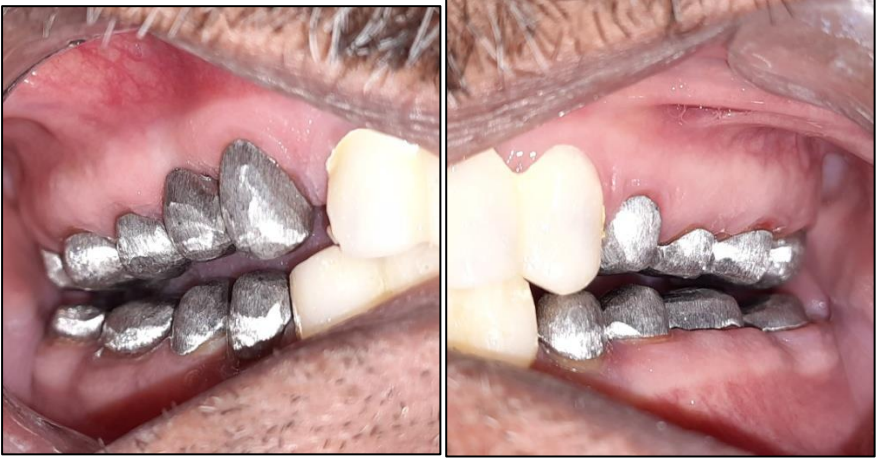
Figure 14, Metal Try Infor Left And Right Posterior Crowns