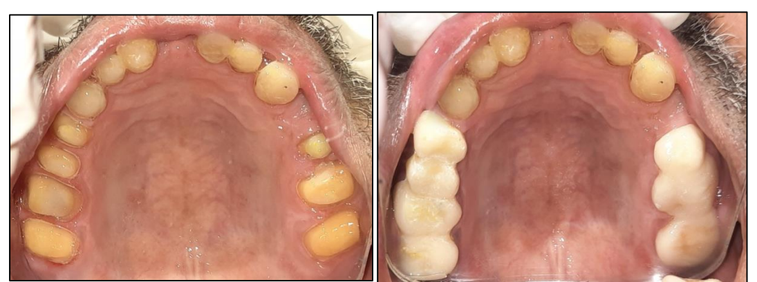
Figure 9, Maxillary Posterior Teeth Preparation And Temporisation