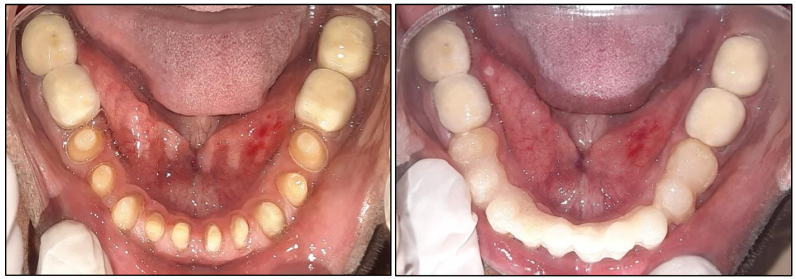
Figure8, Mandibular Anterior Teeth Preparation And Temporisation