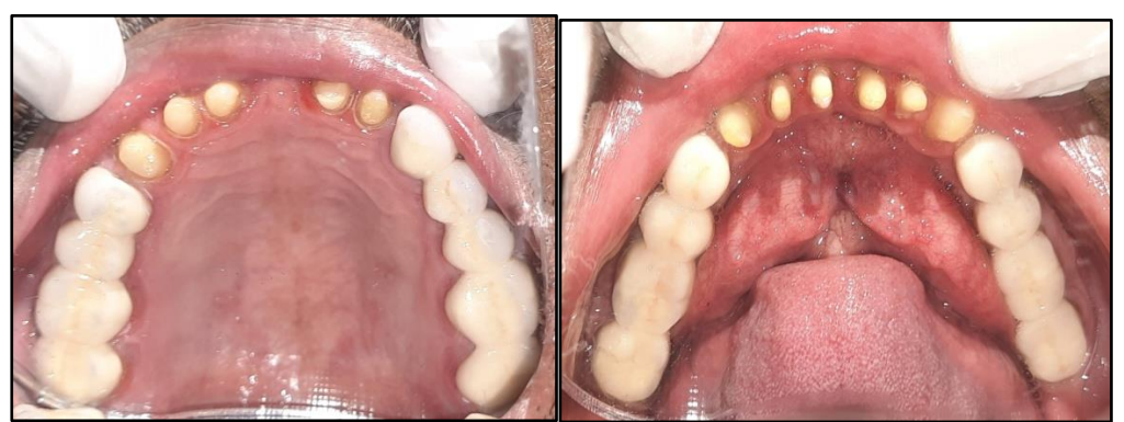
Figure 15, Maxillary Posterior Pfm Bridges Cemented (Left And Right) Figure 16, Mandibular Posterior Pfm Bridges Cemented (Left And Right)