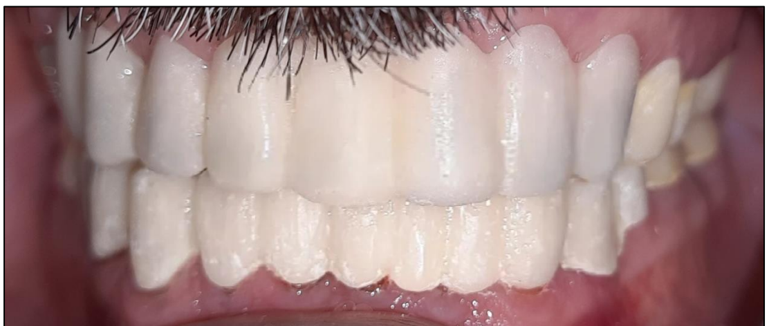
Figure 11, Complete Temporisation