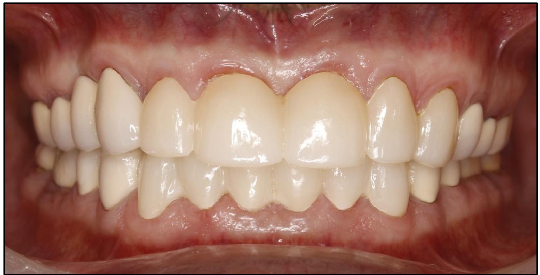
Figure 23, Post Op View (In Centric Relation)