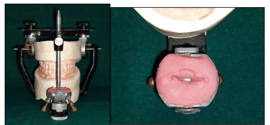
Figure 18, Customised Anterior Guide Table Based On Provisionals