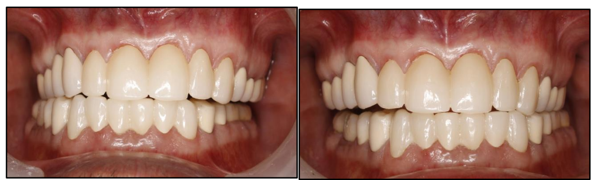
Figure 22, Post Op View (Right & Left Laterotrusion)