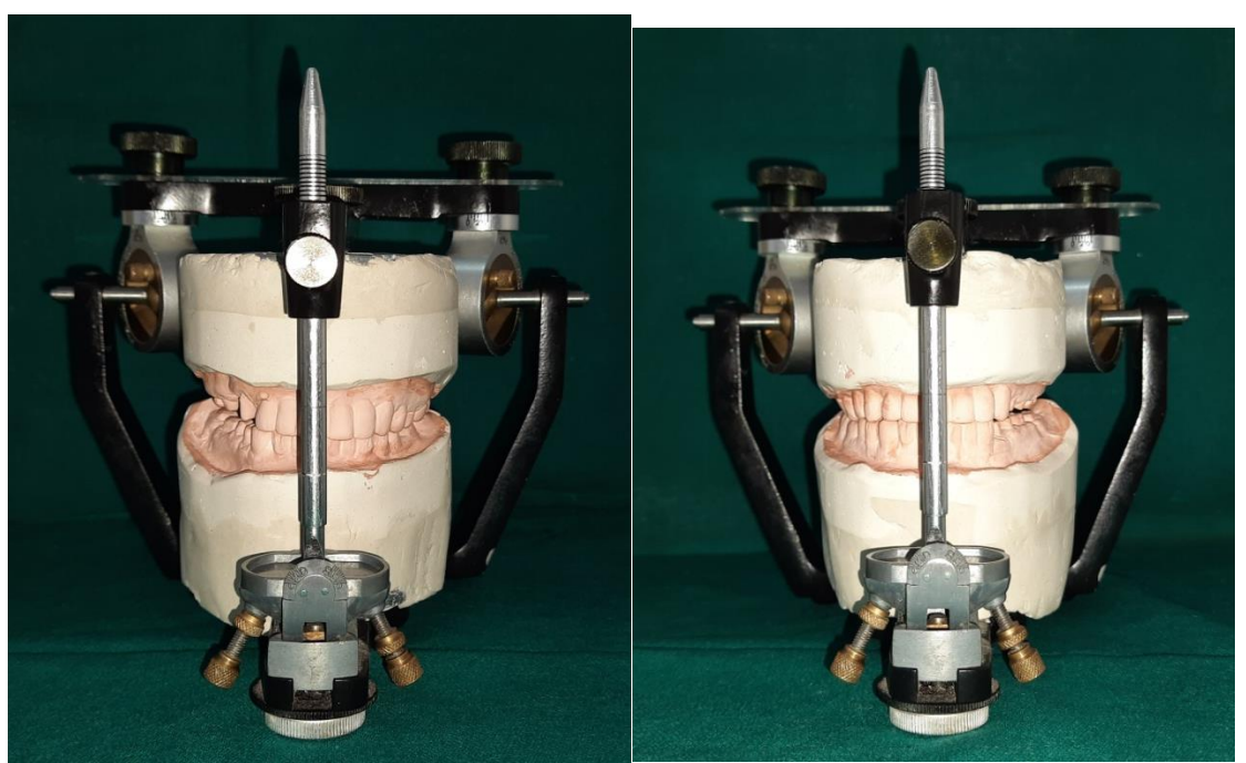
Figure 13, Mountings Of Master Casts For Posterior Crowns At Increased Vertical Dimension