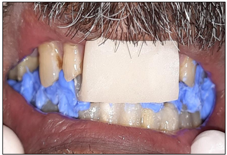
Figure 4, Centric relation record with customized lucia jig