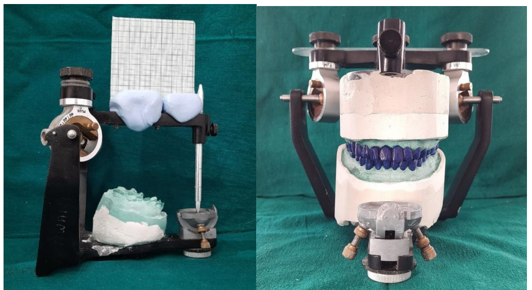
Figure 5, Occlusal Plane Determination Broadrick's Occlusal Plane Analysis Figure 6, Mock Up At Increased Vertical Dimension