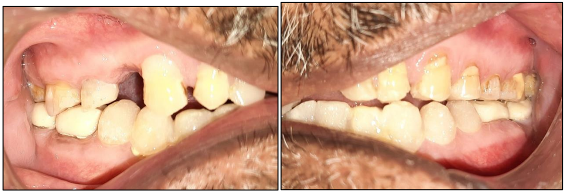
Figure 7, Temporisation Of Molar Teeth With Pfm Crowns At 3mm Rised Bite