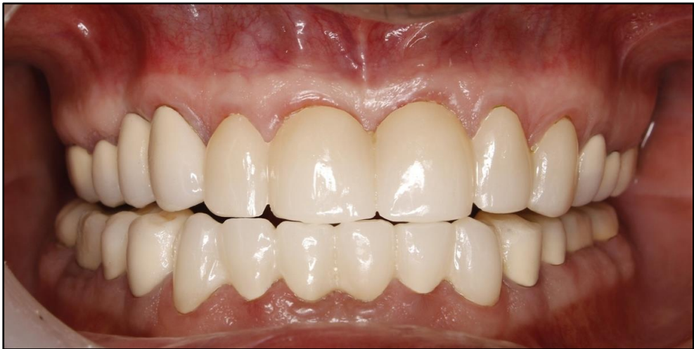
Figure 21, Post Op View (In Protrusion)