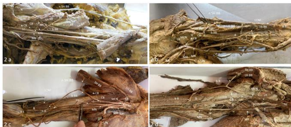
Fig 2: Photograph Of The Axilla And The Arm Showing Musculocutaneous Nerve Not Piercing The Coracobrachialis Muscle. Fig. 2a Also Shows That The Nerve To Coracobrachialis Arises Directly From Lateral Cord Of Brachial Plexus, Not As A Branch Of Musculocutaneous Nerve. Fig. 2c Also Shows The Presence Of A Communicating Branch Between The Musculocutaneous Nerve And Median Nerve. [Fig. 2a And 2b Are Left Side; Fig. 2c And 2d Are Right Side).