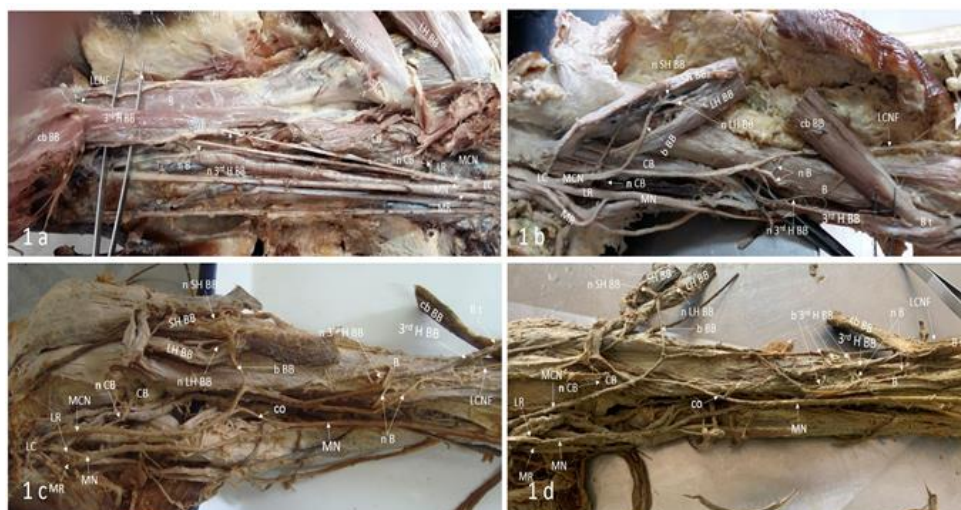
Fig 1: Photograph Of The Axilla And The Arm Showing Musculocutaneous Nerve Not Piercing The Coracobrachialis Muscle And Supplying An Additional Third Head Of Biceps Brachii. Fig. 1c And 1d Also Show The Presence Of A Communicating Branch Between The Musculocutaneous Nerve And Median Nerve. [Fig.1a Is Right Side; Fig.1b, 1c And 1d Are Left Side]