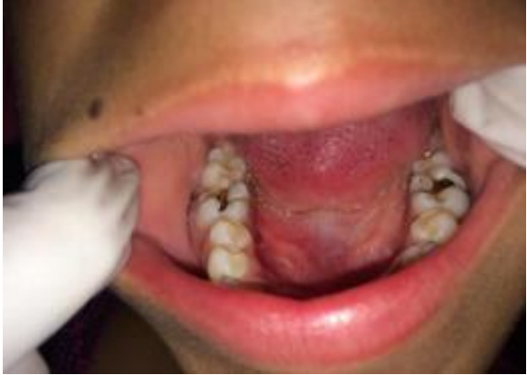
Figure 1:C:- Intra oral examination revealed patient had grossly carious mandibular first molars. [#36 and #46]