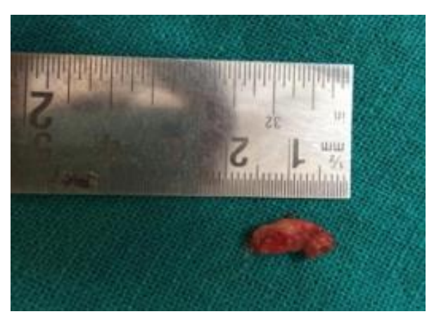
Figure- 5- Dimension Of Specimen Sinus Tract Fragment.