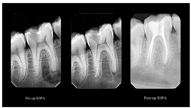
Figure-7 Pre And Post Operative Radiographic View Of Successful Intervention With The Help Of Endodontical With Surgical Procedures.