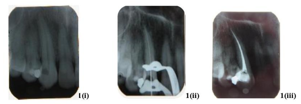
Figure 1: (i) Pre-Operative Radiograph, (ii) Working Length Radiograph, (iii) Obturation Radiograph

Root canal filling: Fifteen days later, the calcium hydroxide dressing was removed using a K file size # 40 under copious irrigation with sodium hypochlorite and 17% EDTA solution. The canal was dried with absorbent paper points. AH Plus cement (Dentsply/Maillefer, Ballaigues, Switzerland) was prepared according to manufacturer's instructions and inserted into the root canal together with the #40 gutta-percha point to working length. Lateral condensation of accessory gutta-percha points was done. Excess filling material was removed using a heated gutta-percha condenser. A radiograph was taken for treatment assessment (Figure 1(iii). Subsequently, the pulp chamber was cleaned and restored with composite.