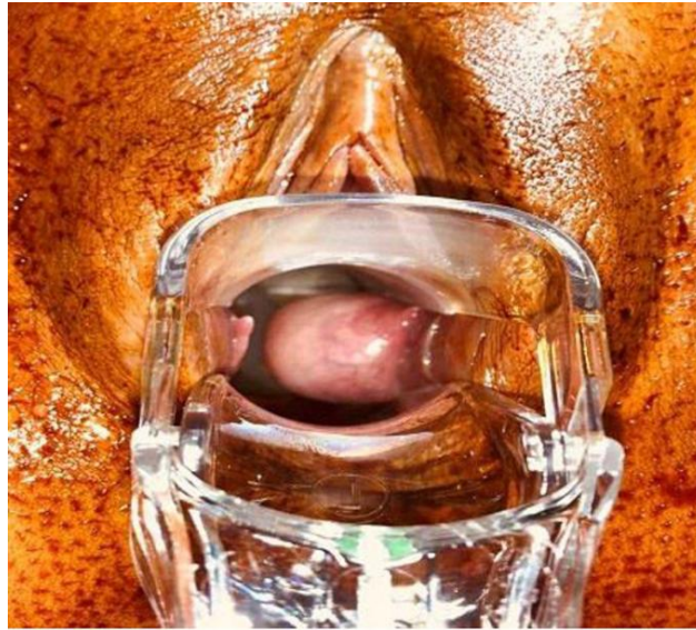
Fig. 1 Cyst in the lateral vaginal wall

the cyst, a normal vaginal delivery was performed without any complications ( Fig. 4 ). Informed consent was obtained from the patient for the publication of the case report.