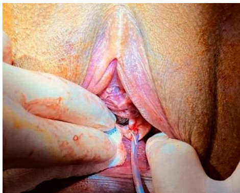
Fig. 4 Drainage catheter placing into the cyst