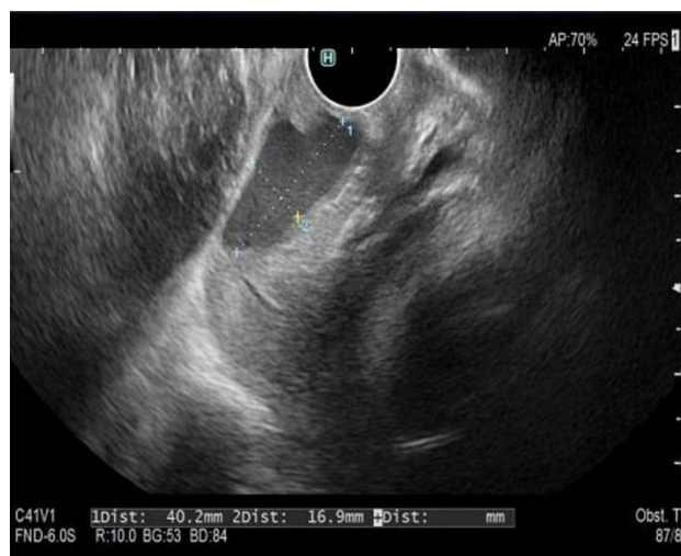
Fig. 3 Transvaginal Ultrasound images