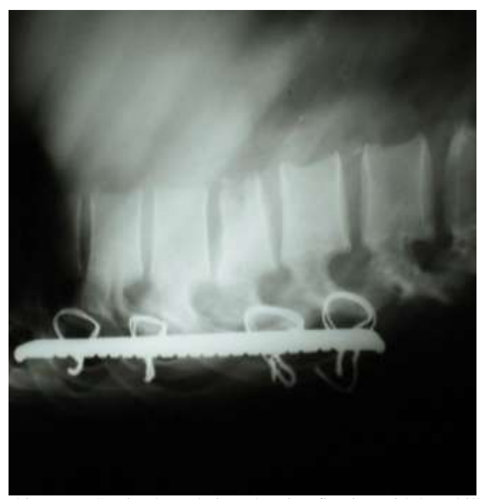
Fig:3 Post operative skiagram LS spine lateral view showing fixation with hartshill rod and autogenous cancellous bone grafting