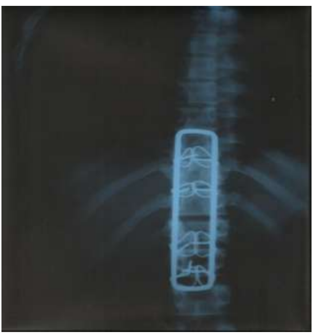
Fig: 2 Post operative skiagram LS spine AP view showing fixation with hartshill rod and autogenous cancellous bone grafting