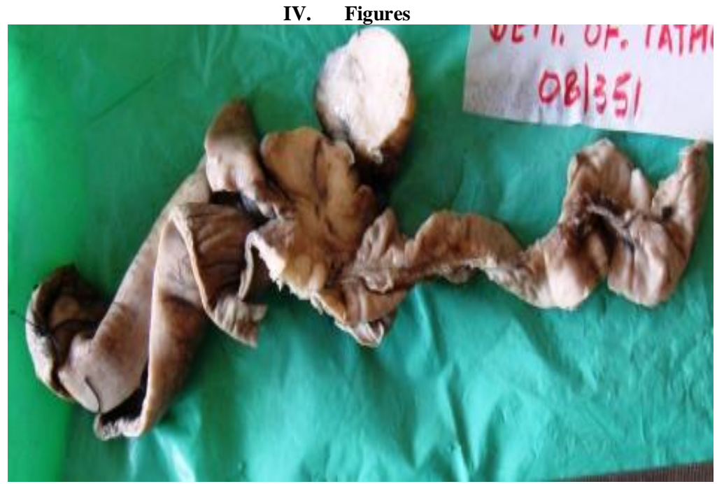
Figure 1 :Gross photomicrograph revealing a well circumscribed, gray white tumor on serosal aspect of small intestinal segment(ileum).

Tumor resolution or regression has been reported after radiotherapy, chemotherapy and steroid therapy. Local recurrence after incomplete excision is recognized. Few series shows 37% local recurrence, 11% developed distant metastasis and 5 died from disease. This underlies the importance of complete surgical resection whenever possible 11.