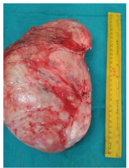
Fig 5: 26 \times 22 \times 10 cms fibroid post enucleation weighing 2.8kgs