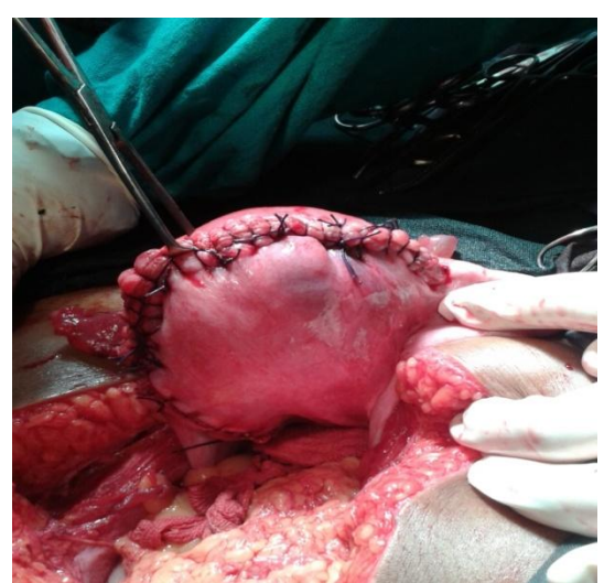
Fig 4: Intra operative picture showing the uterus post myomectomy