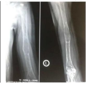
FIG-1,2,4: SKELETAL MANIFESTATIONS OF PHPT

In many Asian countries, routine testing of serum calcium is still not in a general practice. In Eastern India serum calcium monitoring is also not a routinely practice; therefore our study documented only symptomatic presentation in PHPT.