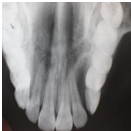
Figure-2 : Inverted pear shaped radiolucency with undefined borders