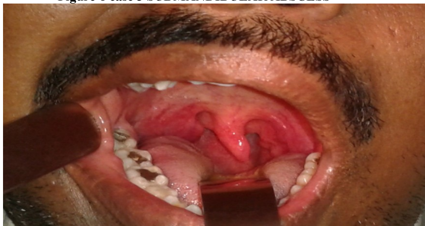
Figure 7 CASE 4 RIGHT PERITONSILLAR ABSCESS