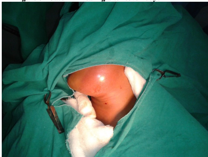
Figure 6 case 3 SUBMANDIBULAR ABSCESS