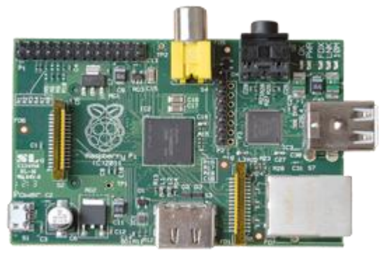
Fig.1. Raspberry Pi model B

Raspberry Pi is a small, multifunctional credit size computer operated in Linux Operating System.