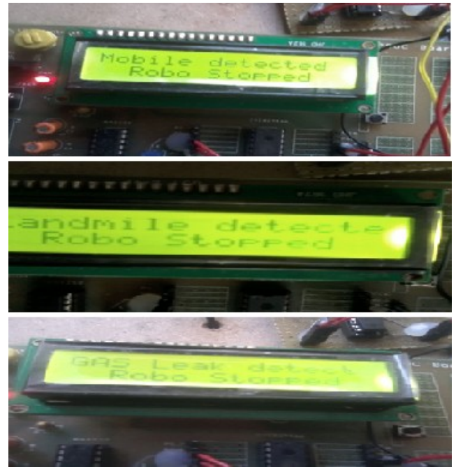
Figure: display system of experiment.