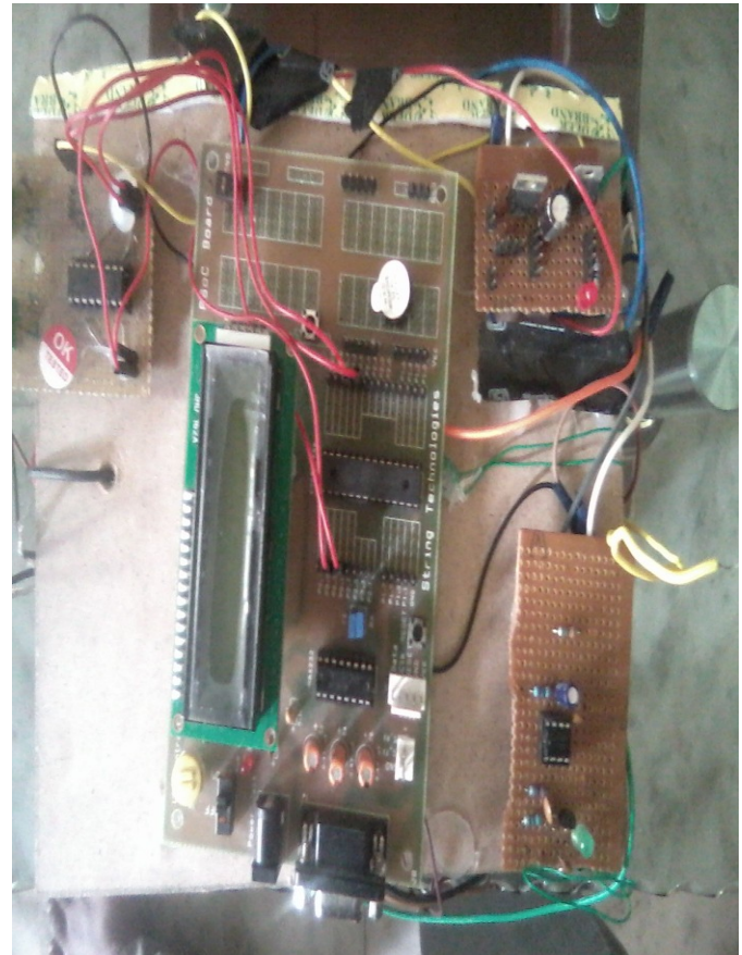
Figure: experimental setup.

The design kit is shown in the figure below. When the signals are detected the path follower which is moving gets stopped and the indication is given on the LCD Display. The results are also shown in the figure below.