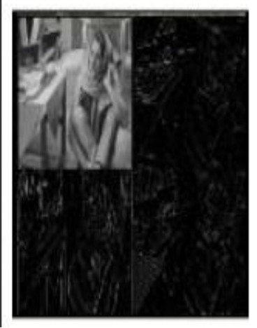
Fig.3 :stegno image with DWT sub bands