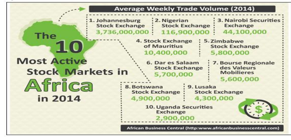
Top 10 most active stock markets in Africa in 2014

Financial markets do perform great roles in the economy at large.Shallow financial markets and inadequate access to finance are major sources of concern in African countries generally, Adelegan (2009). Volatile international capital flows have the tendency to destabilize shallow markets and precipitate a crisis if there is a change in investors' appetite.