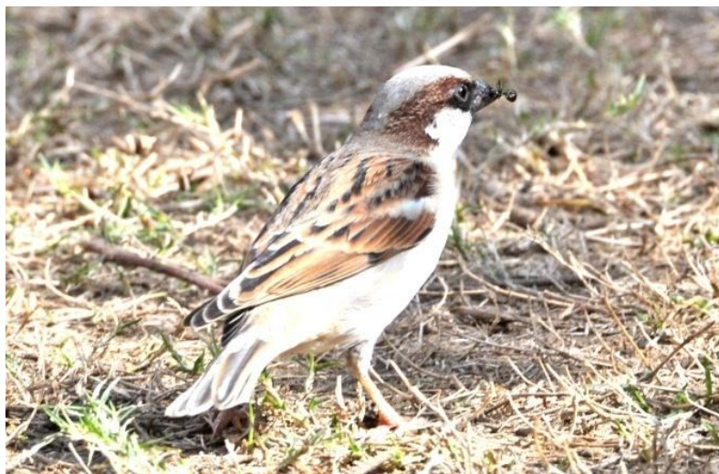
House Sparrow (Male) Feeding