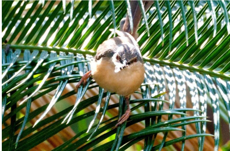
Ashy Prinia Feeding