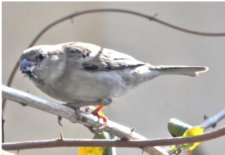
House Sparrow (Female) Feeding