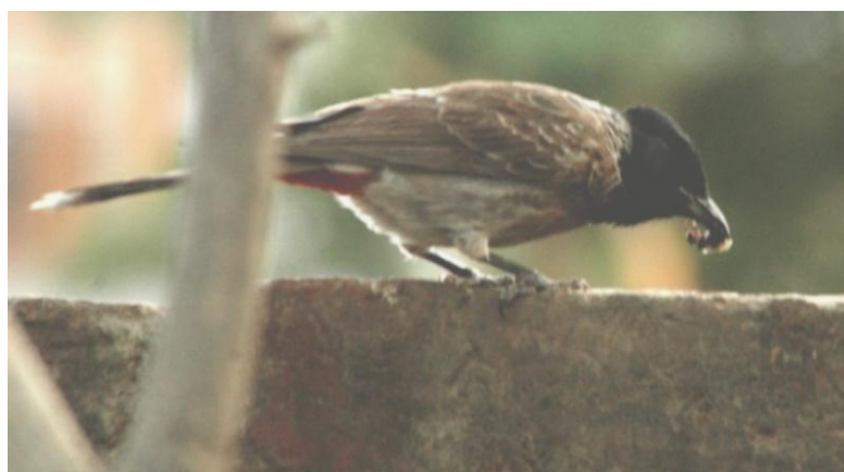
Red-vented Bulbul Feeding

There are two contrasting views regarding feeding strategies of insectivorous birds: they may be opportunistic feeders and exploit patchy insect aggregations (Gould 1978; Fenton and Morris 1976) or may be non-opportunistic and select from among available insects (Whitaker 2004; Brigham 1990). The birds seems to belong more likely to the first group. Although ants reported in the diet of Indian Robin but ant alates not comprise the majority of its diet.