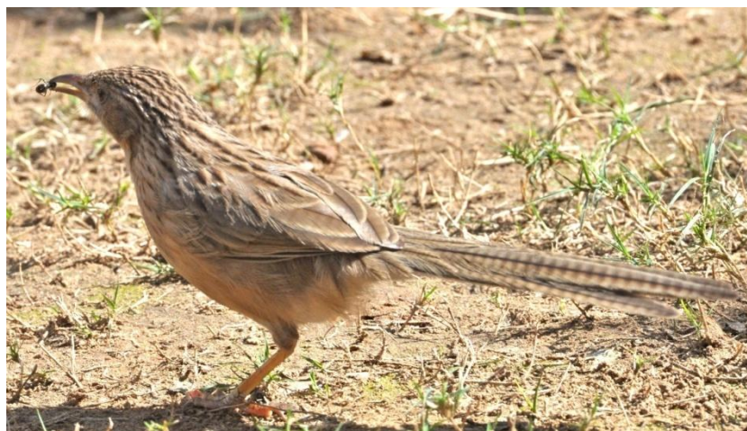
Common Babbler Feeding