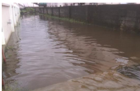
Plate 2: Section of a Residential Property within Commissioners Quarters, Ekeki – Yenagoa town, Bayelsa State during raining season (the settlement lacks drainage facility)