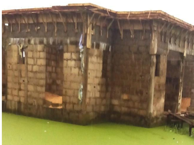
Plate 4: An On-going residential property development in a Floodplain area within Okaka residential neighbourhood of Yenagoa, Bayelsa State. The site is being accessed through Plank Footpath locally called ‘Monkey Bridge’