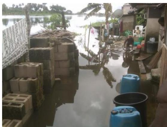
Plate 1: Section of Residential Property Development on Water front without Flood Preventive measure in Igbogene, Yenegoa, Bayelsa State

Table 3.3 shows the analysis of social criteria/strategies. The analysis revealed that the Visual comfort and adequate lighting is very significant as ranked 1 st with RII value of 0.93, signifying 93% that strongly agreed to criterion. Improved security by incorporating security devices was shown by the findings to be the 2 nd with RII value of 0.90 indicating 90%. Improved accessibility has RII Value of 0.89 which is 89% and ranked 3 rd . The other social criteria of indoor air quality/adequate ventilation and making development close to social infrastructure and facilities were ranked 4 th and 5 th with their respective RII Values as 0.83 and 0.81 signifying 83% and 81% respectively. Finally, the results revealed and confirmed that all the listed environmental, economic and social criteria for sustainable property development are significantly important and are therefore considered as critical strategies to make property development sustainable in flood prone lands.