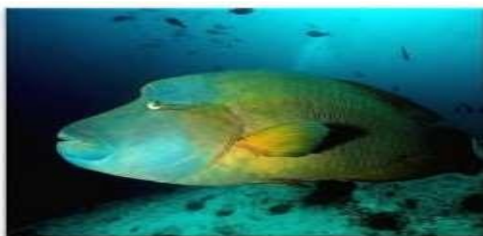
Figure 2. Napoleon Fish

The available amenity is to have several small huts to sell along the beach, so tourists can sit along the beach, especially at high tide. There is a road to reach the top of the steep rock and enjoy the beautiful scenery, which can be used for rock climbing activities. Biodiversity of fish and other aquatic biota can be found at a depth of about 10 – 20 m including various Napoleon fish, one of the protected reef fish, jack fish, including a group of surgeon fish and a group of fusiliers and white tip sharks that roam around this location.