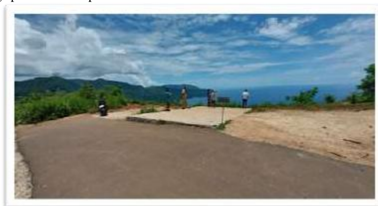
Figure 5. Paralayang Hill

Paragliding Hill is a hill located in Nusaniwe Village and has a height of approximately 100 meters above sea level facing directly to the Seri sea. Paragliding Hill is a tourist destination that is very suitable for tourists to visit for Paragliding sports and take pictures with views of the Seri sea.