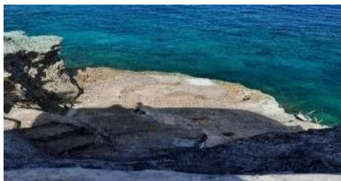
Figure 4. Oxana Cliff

Oxana Cliff is a suitable place to visit for tourists who want to enjoy the beautiful sea view with a view from a beautiful cliff. The combination of white cliffs and greenish sea water makes tourists feel like they are in "Greece". Oxana Cliff also provides many photo spots for tourists so this place is suitable for gathering with family or friends.