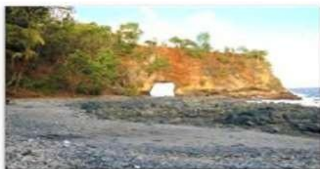
Figure 1. City door Beach in Airlouw

City door Beach tourist attraction is located in Airlouw, Nusaniwe Country, Nusaniwe District. Accessibility to this location is easy, you can use two-wheeled and four-wheeled vehicles through the road with good quality. Pintu Kota Beach is one of the popular tourist destinations for tourists.