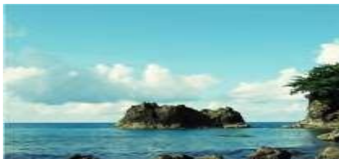
Figure 3. Felawatu Beach

he quality of the road to Felawatu Beach tourism object is in the form of cement, soil, sand and rock, in addition to the availability of modes of transportation to the Felawatu Beach tourism object, there are signs indicating directions to Namalatu tourism object, although the number is still limited.