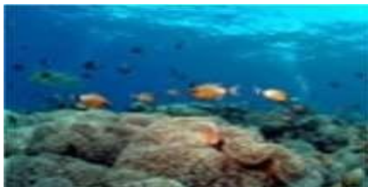
Figure 6. Eri Marine Park

Eri marine park is located in Nusaniwe State, Nusaniwe District. Accessibility to Eri Marine Park. It is quite easy because there are land transportation modes with good road quality.