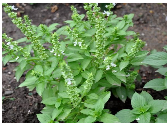
Figure 1: African basil ( Ocimum gratissimum L.)

African basil ( Ocimum gratissimum L.) is an herbaceous shrub notably found in tropical countries including Nigeria, where it is commonly called Clove basil, Sweet basil, tea bush, Scent leaf, or fever plant popularly referred to as 'Effirin' in Yoruba, 'Nchanwu' in Igbo and 'Dai doya' in Hausa is noted for its aroma and used as spices for food or soup preparation in Nigeria [14]. It is widely known for its medicinal use in the treatment of various infections ranging from bacteria to fungal infections [15][16][17]. The plant (Figure 1) is widely cultivated on open fields and backyards farms in the southwestern part of Nigeria. Many species of the genus Ocimum namely: Ocimum americanum , Ocimum basilicum , Ocimum canum , Ocimum gratissimum , Ocimum sanctum and Ocimum suave have been reputed for various medicinal uses [17]. Ocimum gratissimum is an aromatic, perennial herb, 1-3 m tall; stem erect, round-quadragular, much branched, glabrous or pubescent, woody at the base, often with epidermis peeling in strips. Leaves opposite; petiole 2-4.5 cm long, slender, pubescent; blade elliptical to ovate, 1.5-16 cm x 1-8.5 cm, membranaceous, sometimes glandular punctate, base cuneate, entire, margin elsewhere coarsely crenate-serrate, apex acute, puberulent or pubescent. In its native area, O. gratissimum occurs from sea level up to 1500 m altitude in coastal scrub, along lake shores, in savanna vegetation, in the sub-montane forest, and on disturbed land [18].