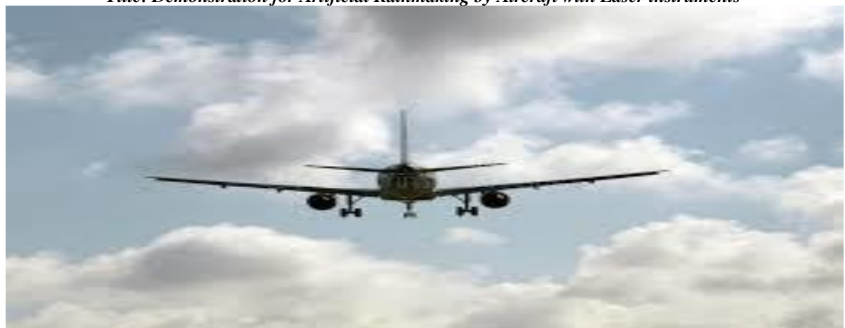
Fig. No. 1 - For Rainmaking by Laser using Aircraft in the atmosphere.

Title: Demonstration for Artificial Rainmaking by Aircraft with Laser instruments