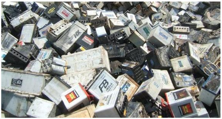
Figure 5 Scrap Batteries