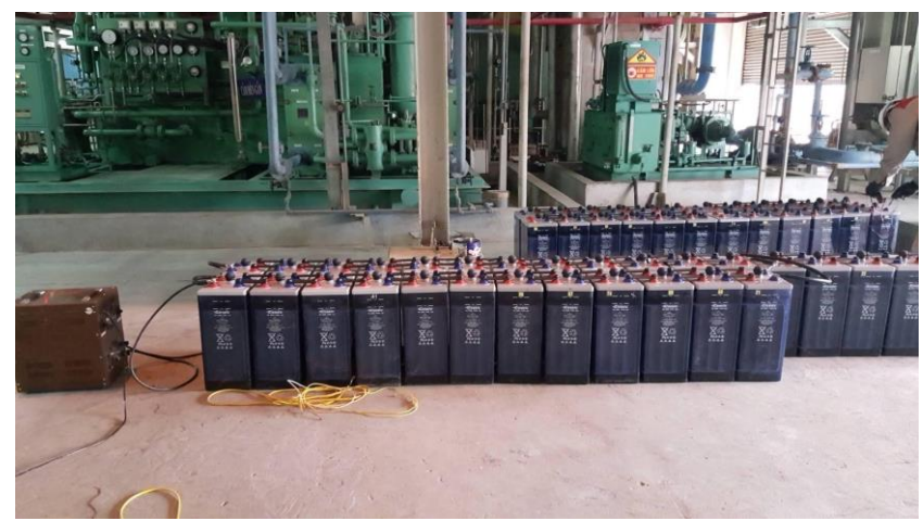
Figure 1. Application