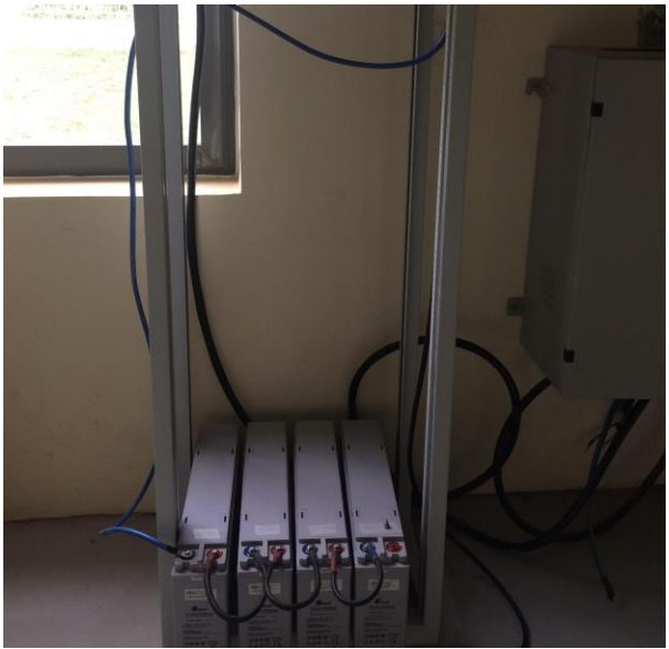
Figure 4 Experiment