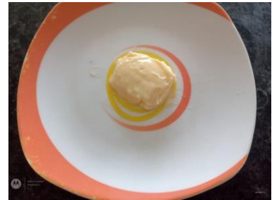
Fig.5 final product (coconut butter)