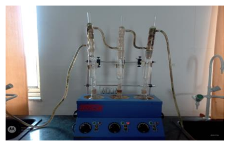
Fig.1 soxhlet method.