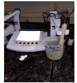
Fig.2 pH test

pH estimation pH paper strips with colour indicators were used. Three readings were taken at once and recorded. An interval of 20-25 min was given for the paper to soak thoroughly after insertion into the creams.