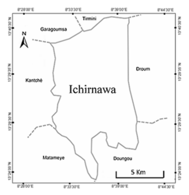
Figure 1: Geographical location of the commune of Ichirnawa

Located between 13°40'30'' and 13°24'00'' North latitudes and 8°28'00'' and 8°44'30'' East longitudes (Figure 1), it covers an area of 395.8 km<sup>2</sup> and has approximately 61,054 inhabitants<sup>16</sup>.