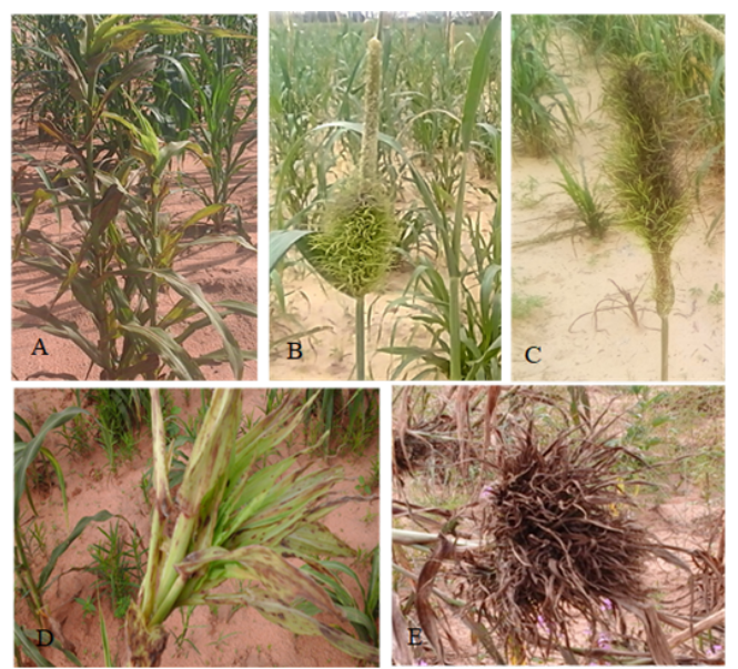
Figure 3: Symptoms of millet downy mildew at the maturity stage: A) Necrotic coloration of the plant, B) Partial transformation of the ear, C, D and E: Total transformation of the ear

All the fields surveyed are infested with millet downy mildew. The prevalence and incidence of the disease were determined for each field on 500 pockets. Only (6%) of the fields have a prevalence of less than 100%. The incidence of the disease varies from 1% in the fields of Babadou in the North to 64% in the fields of Ichirnawa in the South. Thirteen percent (13%) of the fields surveyed have an incidence of less than or equal to 10%, twenty-nine percent (29%) have a moderate incidence of between 10% and 20%, fifty-six percent (56%) of the fields have an incidence of between 20% and 50% and two percent (2%) of the fields have an incidence of more than 50% (Figure 4). During this survey, out of a total of 50,000 millet pockets examined, 13,627 pockets showed symptoms of the disease, representing an average overall incidence of 27.25% and an average prevalence of 98% for the municipality.