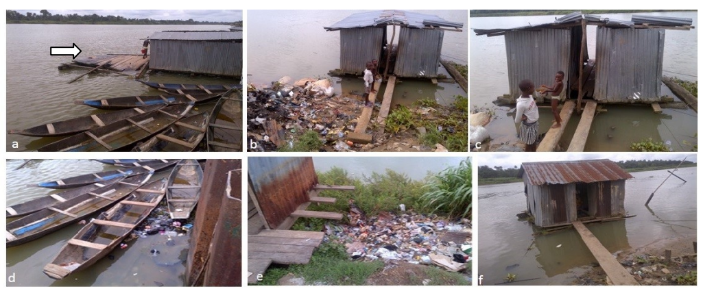
Figure 1; Unhygenic practices of local dwellers in Bayelsa State in Nigeria.

In the developing world, an estimated 10 million children under-five die of diarrhea related diseases of these deaths, WHO estimates that 16.5 percent, or at least 1.65 million, were caused by contaminated water (25). Deaths caused by nondiarrheal infections like typhoid fever are also related to contaminated water (9). (20) found that 10.7 million infections and 5.4 million illnesses/year occur in populations served by community groundwater systems; 2.2 million infections and 1.1 million illnesses/year occur in noncommunity groundwater systems; and 26.0 million infections and 13.0 million illnesses/year are reported in municipal surface water systems as water can be a carrier of many water-borne diseases, such as typhoid, cholera, hepatitis, dysentery and other diarrhoea-related diseases. Shortage of clean drinking water has been an issue faced with most coastal and riverine communities in Nigeria. This situation prevailed in many developed countries in the past some three centuries ago, until measures for sanitary disposal and supply of potable water were put in place. There is enough evidence to show that the prevalence of typhoid in any community is an index of communal hygiene and effectiveness of sanitary disposal (4). The poor sanitation and unhygienic practices are evident in both urban and rural areas of Nigeria as shown in Figure 1.