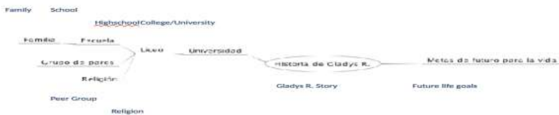
Diagram N°2. Socialization agents and goals: