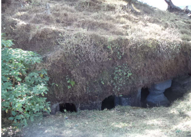
Figure 4: The abandoned church, eastern view of the rock-hewn church

comparison with the external colonnades at Bete Medhane Alem, Lalibela, and Gennete Maryam near Lalibela. The colonnades are sculpted merely to support the roof and, unlike the columns in the nave, they have no any kind of architectural affinities. The roof in the exterior part is uneven and little decorated. This part generally measures 7.5 meters in length, 18meters in width and 2.25meters in maximum height (more than one meter to the ground may be filled by alluviation). Here, all height measurements of the hypogeum are already taken above the deposit that layered in the floor of the church. Excavation work to get the rocky floor of the church for the purpose of measurement is not made. It is because I believe that it is better to leave this activity for the sake of further detail archaeological work. This part was probably a chanting room that could congregate many people together.