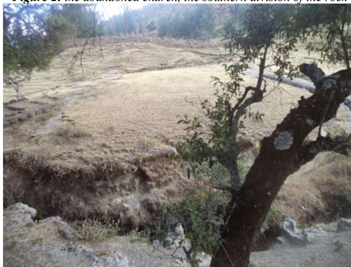
Figure 2: the abandoned church, the southern division of the rock