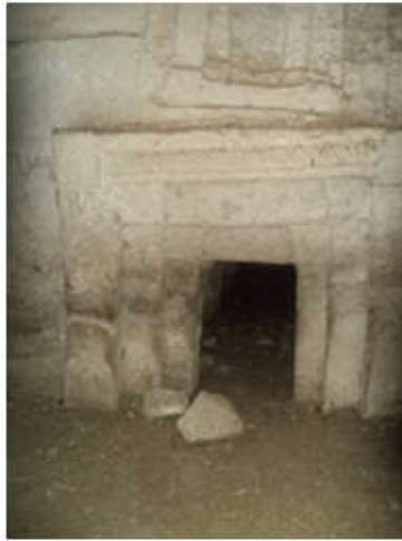
Figure 6 (right): The abandoned church, a portico view into the sanctuaries