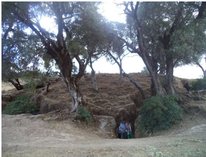
Figure 3: The abandoned rock-hewn church, the northern division, northern view

More attention is given to the northern division of the rock in which excavation of a hypogeum is realized. Its plan tends to be round. It is surrounded by trenches which separated the church from its parent rock. The longest trench is already described above. Another trench that measures 16 by 2 meters with varying height is hollowed out in the western part of the northern complex. A third trench is also planned to drain flood run out from the southern side. It is connected with another short trench that separates the southern complex from its parent rock. It also leads in to an entrance opened towards the southern division of the rock. The excavation of the trenches and tunnels, as it is well developed at Lalibela rock-hewn churches (Mengistu 2012, p. 74), have different purposes including networking separately excavated rock-hewn churches, draining water from interior courtyards and entrance and exit peoples.