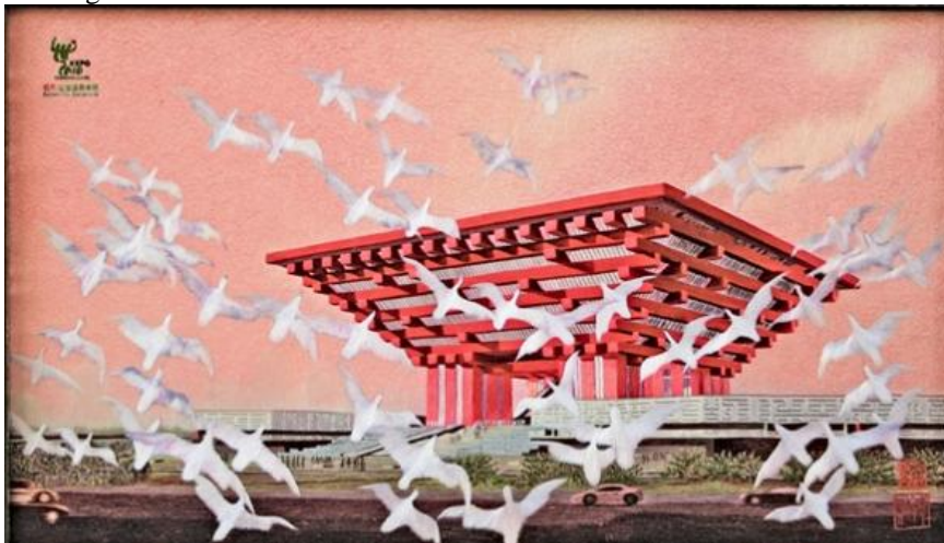
"Peace in China," 2010, Hunan Embroidery Research Institute, Shanghai EXPO Museum, http://www.hnemb.com/channels/108.html .

The Hunan Research Institute has also made some great strides in trying to increase people's awareness of Hunan embroidery's artistic and cultural value. For instance, during the 2012 Shanghai EXPO, there was a project for thousands of tourists to help create a giant piece of embroidery of the Shanghai EXPO under professional Hunan embroiderers' guidance. 80 This was one of Hunan Embroidery Research Institute's attempts to increase the sales of Hunan folk arts in other provinces and to attract business partners in other countries. 81 However, the exportation of Hunan embroidery is limited to a few Asian countries due to government restrictions and tax requirements. 82 Thus as of now, the main consumers at the Hunan Embroidery Institute are still Chinese government officials who often bring Hunan embroidery as gifts for their foreign missions. 83 Others are government-owned corporation owners who make orders for large embroidery pieces to exhibit in the lobbies of their buildings. 84