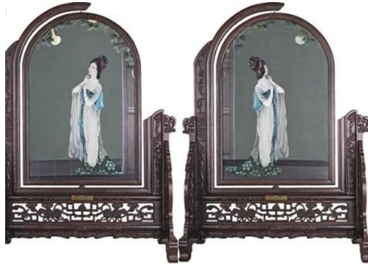
"Moon Watching," 1984, Hunan Embroidery Research Institute, http://www.hnemb.com/channels/212.html .

Embroidery Research Institute. 59 Before the 1980's, the type of embroidery that required the most technique and experience was double-sided embroidery, which has the same picture on both sides of the silk. Now with double-faced embroidery, there are two different pictures on both sides of the silk. This often requires an embroiderer on either side of the silk, and when the needle goes through the silk from one side to the other, the person on the other side takes the needle and hides the thread underneath the original threads on her side of the silk. 60 One of the most famous pieces of double-faced Hunan embroidery is called "Moon Watching": on the one side of the silk, the lady is looking at the moon from the outside of her room; on the other side of the silk, the lady is looking at the moon from the inside of her room. 61