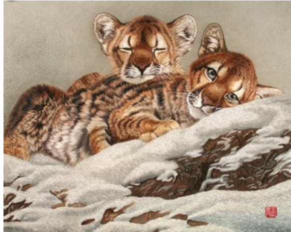
"Affection," Hunan Embroidery Research Institute, 2005,

http://www.hnemb.com/channels/106.html .