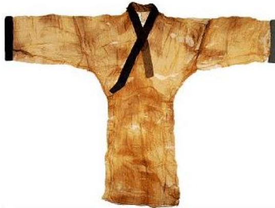
"Ma-Wang-Dui Silk Gown," Hua Xia, http://www.huaxia.com/zt/zwhw/2004-67/

During the Qing dynasty (1644 A.D. to 1911 A.D.), many new forms of needlework for embroidery were invented with an increasing population of embroiderers. 6 The lower class women enjoyed embroidery because it beautified their lives. For example, they sewed simple pictures on their fabric shoe tops, waist band, pillow, and hats. 7 The girls from the upper class, on the other hand, viewed embroidery as a good way to spend their leisure time and to show off their wealth 8 . Before China's last imperial dynasty, Qing, was overthrown in 1911, most of the government garments were elaborated with embroidery, with the emperor's concubines and court officials as the largest consumers. 9