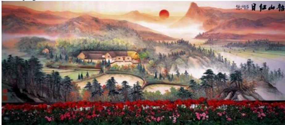
"Blooming Flowers Under the Red Sun," 1972, Great Hall of the People in Beijing, Museum of Hunan Embroidery Research Institute, http://www.hnemb.com/channels/212.html .

In order to purge “revisionist thought” during the Cultural Revolution, the government forced the designs of Hunan embroidery to become less ornamental, and to serve political purposes. 52 For the first time Hunan embroidery included portraits of political leaders and famous soldiers. 53 Embroidery pieces that portrayed flowers and peonies were still appreciated because they represented the “embroiderers’ love for the new government system.” 54 Embroiderers quickly adjusted the themes of Hunan embroidery to celebrate Communism and to show their passion for the bright future, using this old art form to reflect their new life. For example, the piece “Blooming Flowers under the Red Sun,” depicted a reddish, golden sun that symbolized the Chinese government. 55 It has been displayed in many museums and now exhibited in the lobby of the Great Hall of the People in Beijing. 56