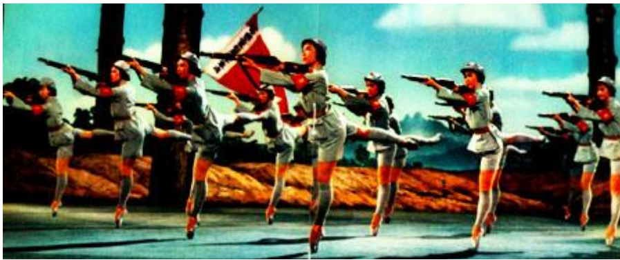
"Soldiers of the Women's Company," 1968, http://www.nyu.edu/classes/ keefe/twenty/mao1.html

One of the objectives of the Cultural Revolution was to "socially purify" the arts, which included Beijing operas, folklores, and embroidery. 36 The communist party replaced old movies and Beijing operas with new ones which were allowed to depict only eight revolution-related themes: communist activities during the Sino-Japanese War, civil war with the Nationalists, and the class struggles after the founding of People's Republic of China. 37 Worker committees took over the theater production studios, and even children's puppet theaters were closed down for being counter-revolutionary. 38 According to Mao-Ze-Dong, “Revolutionary culture is a powerful weapon for the broad masses of the people. It prepares the ground ideologically before the revolution comes and is an important, indeed essential, fighting front in the general revolutionary front during the revolution.” 39 To put the idea into action, his wife, Jiang Qing, was in charge of the arts during the Cultural Revolution; she reviewed more than 1,000 operas and concluded that nearly all of them were unacceptable because they dealt with "emperors, officials, scholars and concubines"—ideas from the “Four Olds”. 40 Therefore, Jiang commissioned a series of "revolutionary modern model operas" with heroic figures that displayed socialist virtues. 41