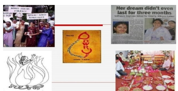
The Picture intends to explore the various practices of dowry in the society

From the above statistics and the picture below the problem of dowry is more strengthening day to day and the laws which are prevailing in India should also be strengthened.