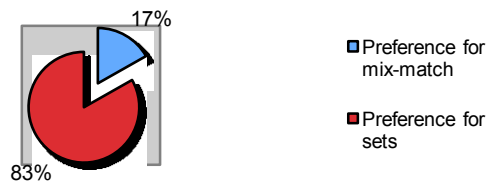
Fig 4: Purchase preferences of consumers