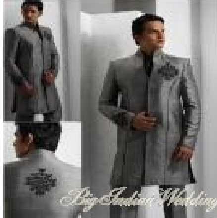
Fig 5: Occasion wear as a major purchase category

On issues of silhouette, it emerged that the consumers prefer classic styles or a combination of experimental and classic styles. Manish further added that though people want experimental, but end up picking classic styles as they do not want to look too different from the crowd.