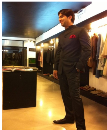
Fig 7: The classic silhouette preferred by customers