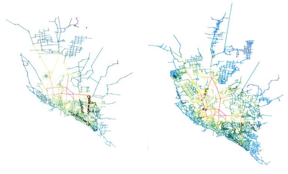
Retail Land Use Figure 6: Axial map of Dhaka showing the unplanned retail growth along the integration core in 1952, 1962, 1972 and 1995.

middle class consumer groups and informal retailers due to migration factor, have all enabled a spontaneous and rapid growth of retail in Dhaka.