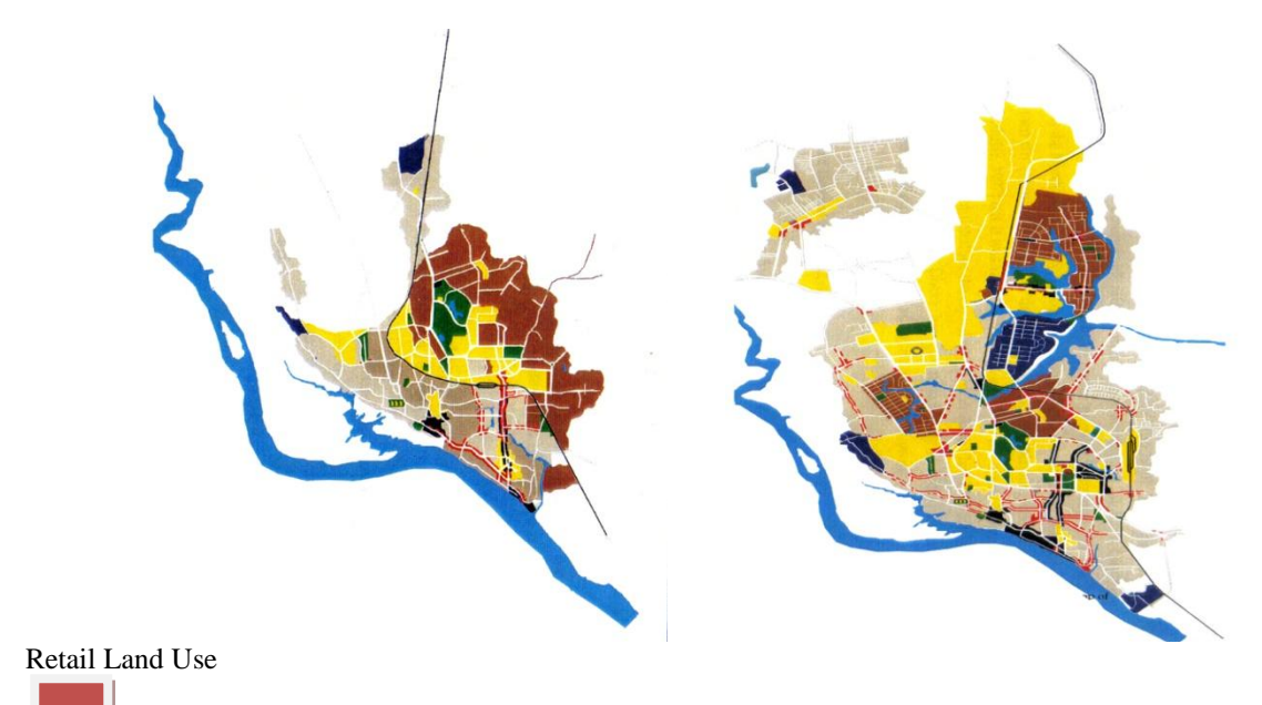
Figure 1: Land use map of Dhaka City – 1952